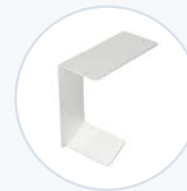
Bracket, Printer, Zebra QLN220 WF-PBRKT-ZQLN2