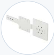
e-Signature Pad, VESA Mount WF-SIGNPAD-VESA