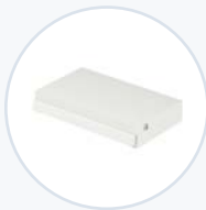
Drawer, Single, Locking WF-DRWR-SL