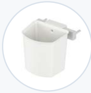
Side Supply Bin Kit WF-SSUPBIN

Equipment changes over time and our line of accessories can be added or removed to fit your application needs.