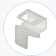
Bracket, Scanner Cradle, Code 2600 WF-SCNBRKT-CD2600