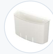
Rear Supply Basket, Polymer WF-RSUPBASK-P