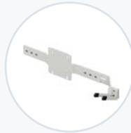
Bracket, Scanner, VESA Mount WF-SBRKT-VESA