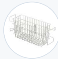
Front Supply Basket, Wire WF-FSUPBASK-W