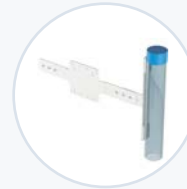
Cup Holder, VESA Mount WF-MEDCUP-VESA