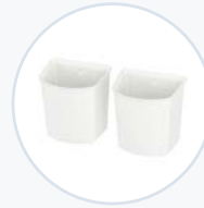
Rear Supply Bins Kit WF-RSUPBINS