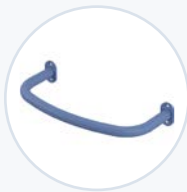
Extended Rear Handle, Steel WF-EXRHAND