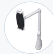
Tablet, Surface Mount AM-TABMNT-S