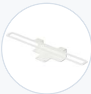
Roll Stand Laptop Security Bracket WF-RLT-SECBRKT