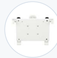
Tablet Mount, Tilt/Swivel WF-TAB-MNT