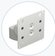
VESA Mount, Tilt/Swivel WF-VESA-MNT