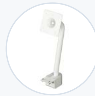
VESA Mount, Light Duty WF-VESA-MNT-LT